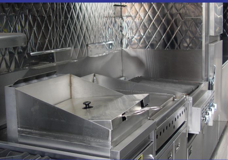
Optional Deep Fat Fryers, Flat Grill, Etc.