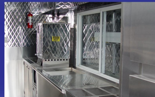
Propane Or Electric Coffee Service Insulated Soda Bins, Steamtables, Etc