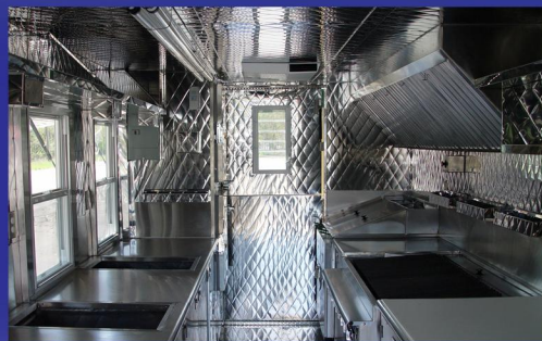
Stainless Steel Interior & Equipment