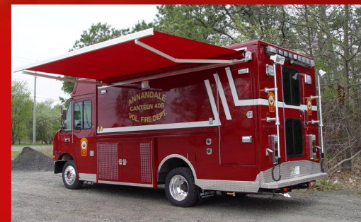
Manual or Electric Awning Available