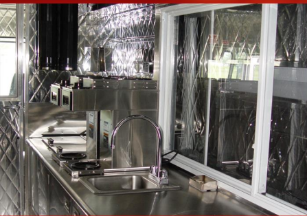
Sink System, Coffee, Refrigeration & Choice of Food Prep Equipment