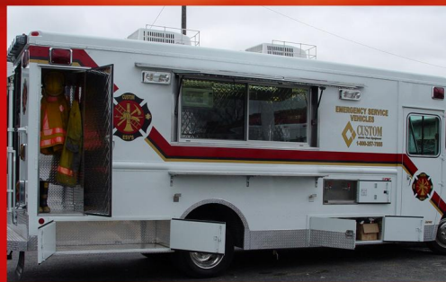
Self Serve Beverage, Exterior Storage Compartments, Scene Lighting, Service Window